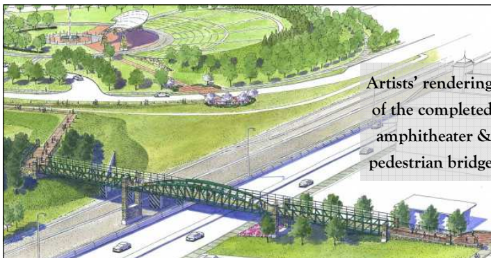
Artists' rendering of the completed amphitheater & pedestrian bridge

If you've visited downtown Alton lately you are well aware that there's much to be excited about, considering the many public improvements that are underway in the area. As the final stages of construction on the new 4,000 capacity amphitheater unfold, anticipation is building to see how the covered open-air pavilion and interactive fountains will take shape. The $5 million project is expected to be completed by next spring.